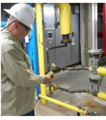
Testing the steam trap to see whether the trap has failed open and is wasting steam.