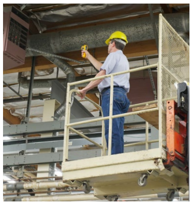
Identifying the temperature of ceilingmount equipment.

Almost all commercial air handling units provide a low temperature limit switch. To prevent the freeze-up of a water coil, the low temperature limit will stop the supply fan. In some cases the low temperature limit may be adjusted incorrectly. You can use the Fluke 64 MAX IR Thermometer to check the calibration of the low temperature limit and adjust as needed.