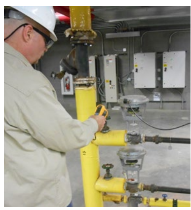
Measuring the steam temperature at the inlet to the humidifier valve.