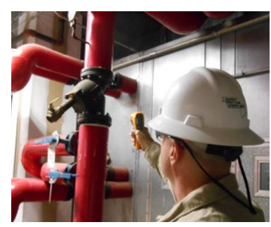
Looking at the water temperature at the inlet to an air handling unit coil.

Many commercial buildings use chilled water to cool the building. The chillers usually provide water at 42 to 44 °F (5.5 to 6.6 °C). Energy will be wasted if the chilled water temperature set point is incorrect. You can use the Fluke 64 MAX IR Thermometer to make sure the chilled water temperature provided to the building matches the set point.