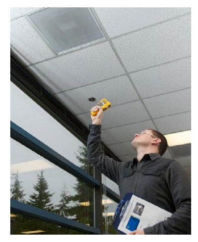
Checking the discharge temperature at air distribution ducts.

A room or space may have several air distribution ducts. One or more of them may be shut off. With the Fluke 64 MAX IR Thermometer you can identify those discharge ducts that are shut off, by checking the discharge temperatures of the different ducts and noting those that do not show the correct discharge temperature.