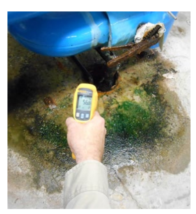
Taking the temperature of condensate as it goes into the drain

It is absolutely critical that products in coolers and freezers are maintained at the correct temperature. The Fluke 64 MAX IR Thermometer can quickly show that the products in a cooler or freezer are stored under the proper conditions. Since you can point the Fluke 64 MAX IR Thermometer at any products in the refrigerated space, it is superior to simple fixed location thermometers. And at the same time you check the product temperatures, you can check the evaporator coil and discharge air temperatures as well.